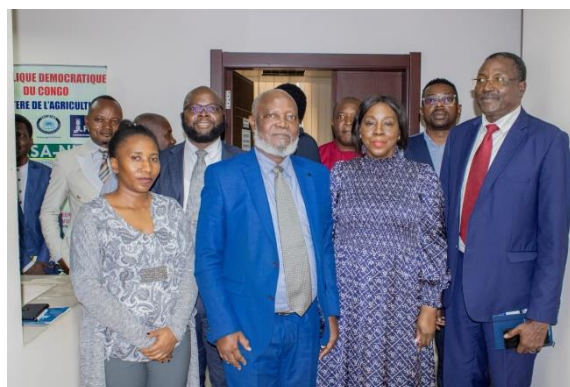
The Alliance and DRC representatives during scoping mission in April 2023.

Members of the Alliance Coordination Team went to the DRC for a scoping mission with the support of AUDA-NEPAD. An Aide Memoire of the Mission was conveyed to the Alliance through AUDA-NEPAD, reaffirming the findings of the Mission and a letter from the Minister of Agriculture has been sent to AUDA-NEPAD requesting support to implement the identified priorities. As part of our collaborative efforts to mobilise support, with other members and partners, preliminary discussions have started with the CGIAR and the World Farmers Market Coalition of how the Alliance can facilitate support to the DRC. This activity will be scaled up in the New Year.